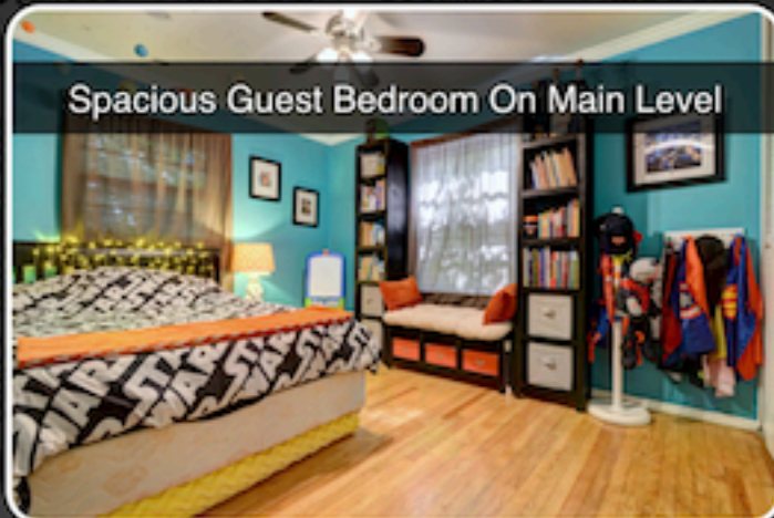
Spacious Guest Bedroom On Main Level