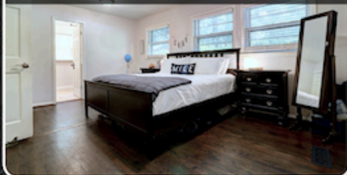
Huge Master Suite Features Double Closets