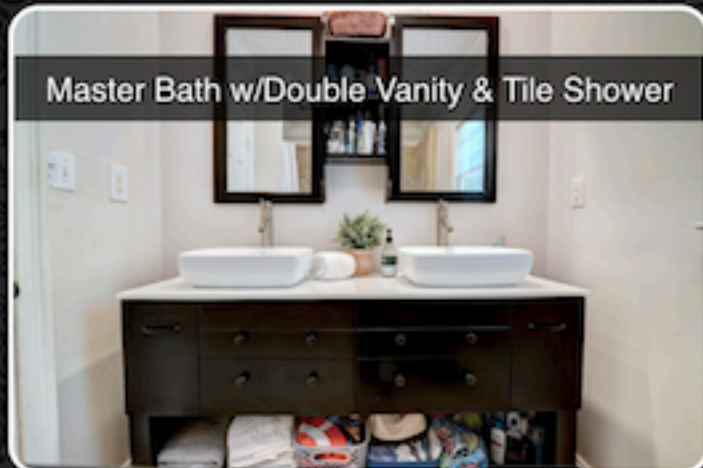
Master Bath w/Double Vanity & Tile Shower