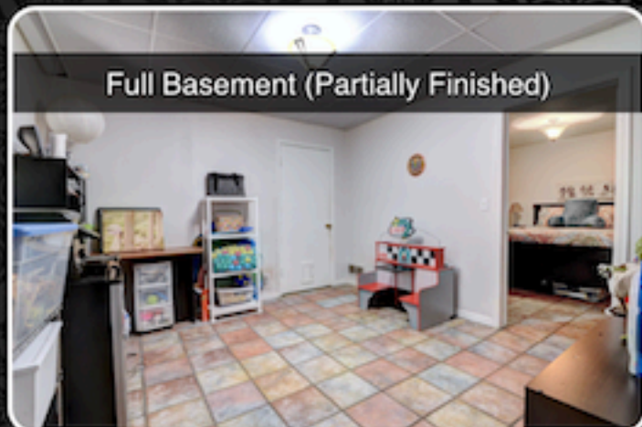
Full Basement (Partially Finished)