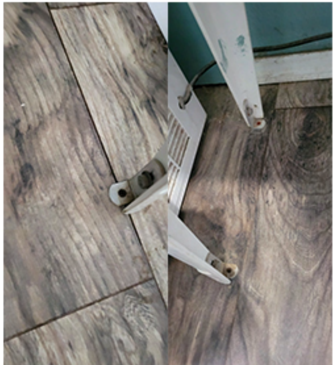
5.4--SELLER SERVICED BY SECURING LAUNDRY ROOM SINK