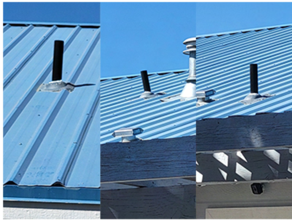
2.3--SELLER SERVICED RUBBER BOOTS OF PLUMBING VENT PIPES ON ROOF