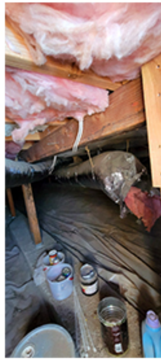
4.5(2)--SELLER SERVICED WITH WIRE NUT TO SECURE LOOSE WIRES