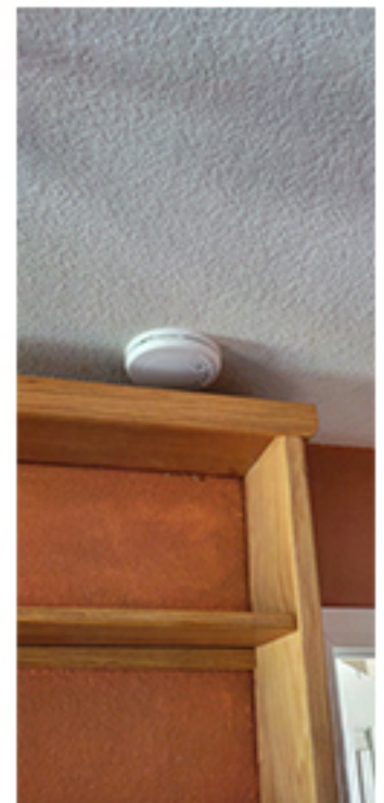
4.5(3)--SELLER SERVICED BY REPLACING FIRE ALARM