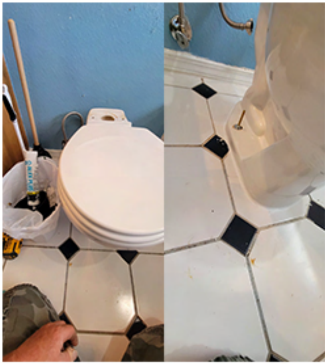
5.4(2)--SELLER SERVICED MASTER BATH WAX RING

ADDRESSES REPAIRS MADE TO DEFECTS DISCOVERED THROUGH HOME INSPECTION REPORT. PLEASE CROSS-REFERENCE HOME INSPECTION REPORT