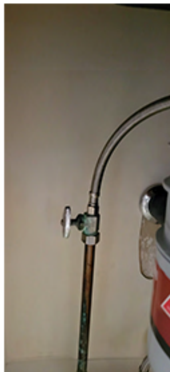
5.1(3)--SELLER SERVICED WITH EXTENDED HOT WATER LINE