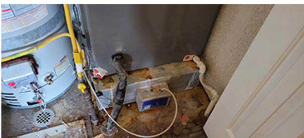
10.2--SELLER SERVICED FURNACE WATER LEAK