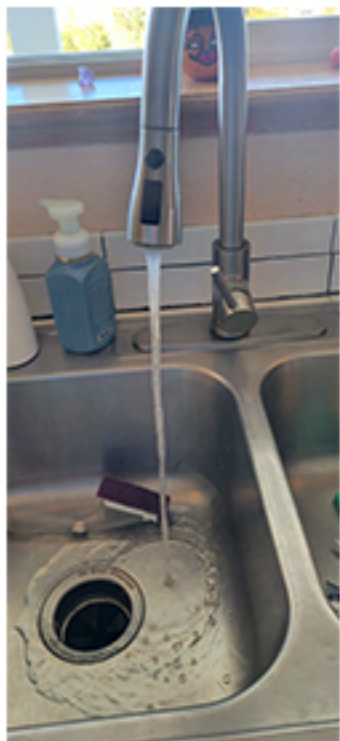
5.1(2)--SELLER SERVICED LEAK ON KITCHEN SINK HOT WATER