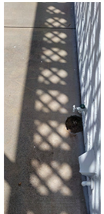
5.0(1)--SELLER SERVICED SOUTH EXTERIOR HOSE BIB