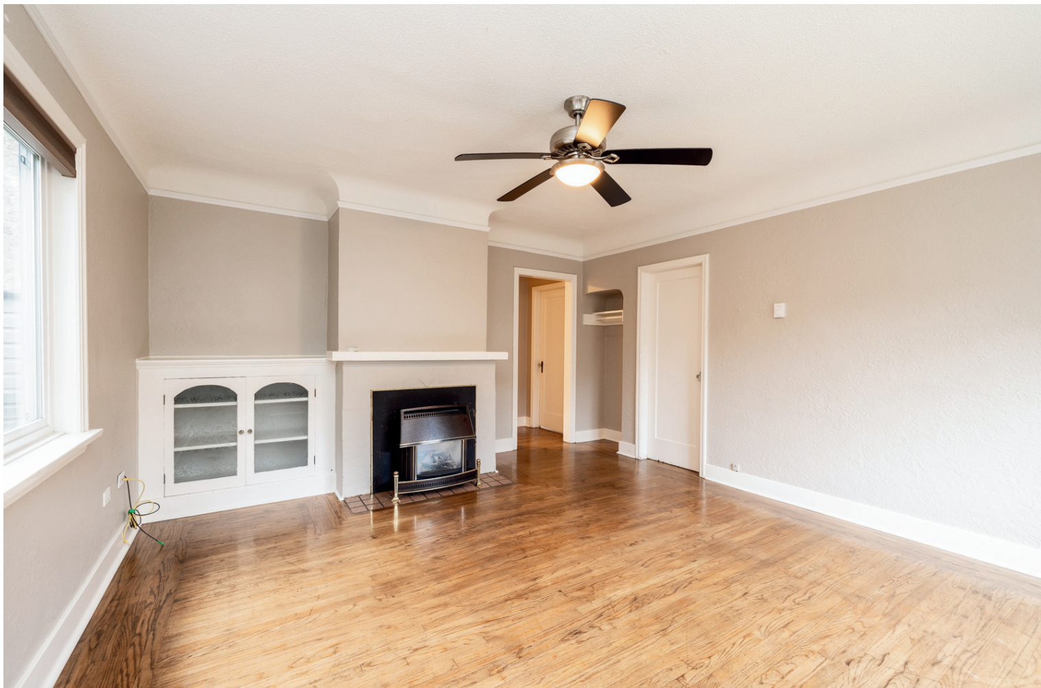
Side by Side Duplex 4 Bed 2 Bath 728 sqft each side

Discover a meticulously designed side-by-side, purpose-built duplex nestled in the vibrant heart of James Bay. This prime location is merely steps away from the iconic Parliament buildings, the charming James Bay Village, the bustling Downtown Victoria, and the picturesque Inner Harbour. Each unit boasts two generously sized bedrooms and a bathroom, featuring polished hardwood floors and modernized bathrooms. Seize this exceptional chance to own an outstanding investment property in one of the city's most sought-after areas.