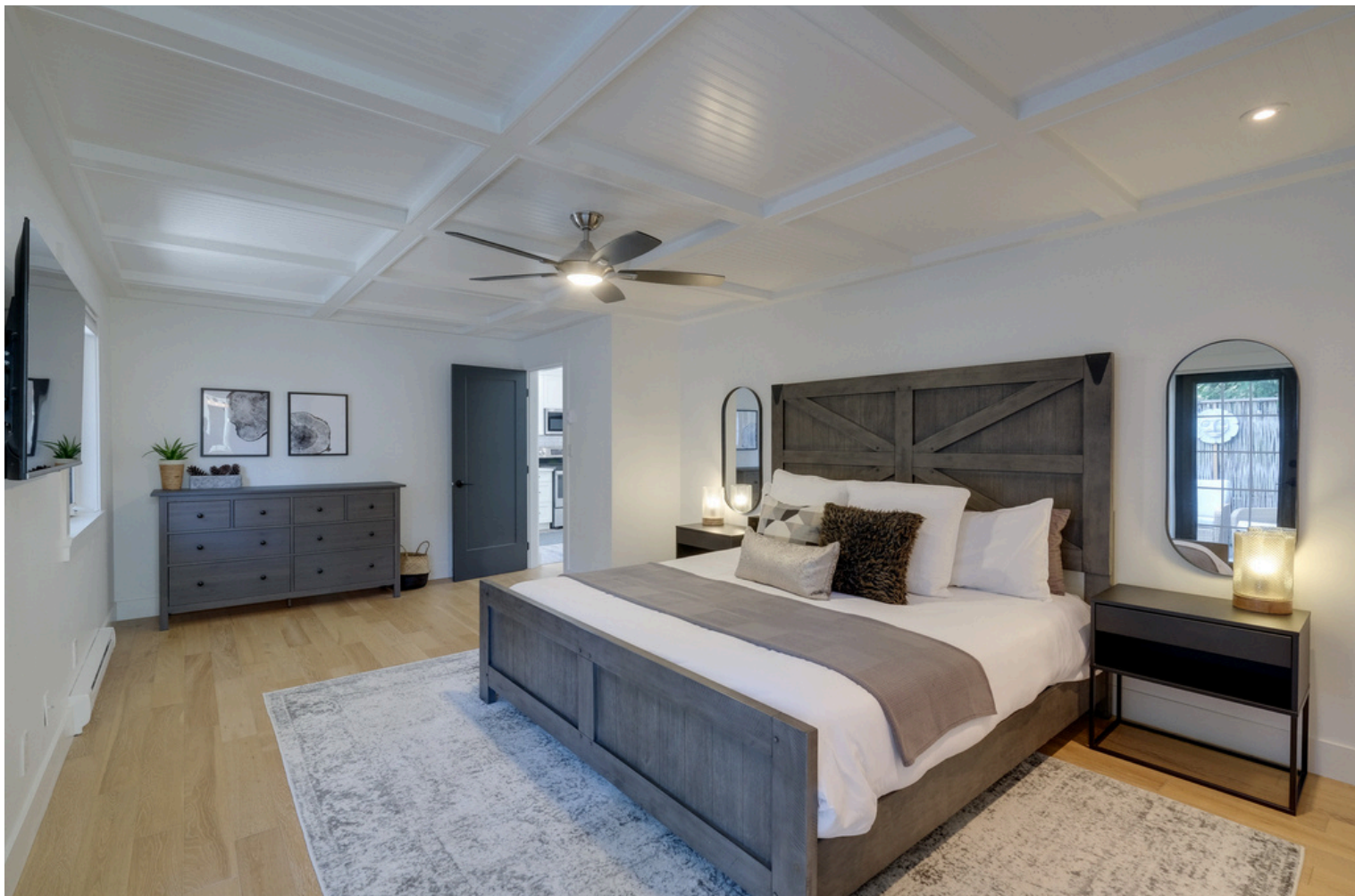
4 Bed 3 Bath 2,202 sq. ft.

Experience modern comfort and outdoor living in this beautifully renovated 1993 home, set on a spacious 0.37-acre lot with a fully fenced yard and large patio, perfect for summer entertainment. The lower level includes two bedrooms, a bathroom, a kitchen, and laundry, with patio access—ideal for family or rental use. The upper level features a light-filled primary bedroom with an ensuite and deck access, plus an additional bedroom and bathroom. The open-plan living area, with access to two decks, and a large garage enhance this serene property's appeal, conveniently located near Victoria, Langford, Mill Bay, parks, trails, and Shawnigan Lake.